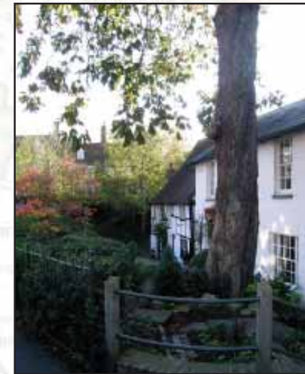
Autumn colours and cottages in Robertsbridge