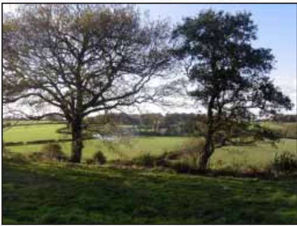
Oast House viewed through the trees

Starting from the public car park in Station Road, Robertsbridge village centre, turn right to head uphill towards the High Street. Turn left at the junction to follow the High Street for a short distance before turning right into Fair Lane, beside the Seven Stars public house. Follow the lane for a distance of approximately 160 metres (175 yds.) before turning right to follow the enclosed section of path around the school playing fields. Cross the stile at the end of the enclosed path, and cross the field to another stile, leading onto the main A21. Cross the main road and continue along the signposted footpath crossing the next field in the direction indicated to reach the woodland.